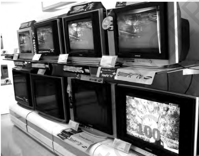
A television showroom