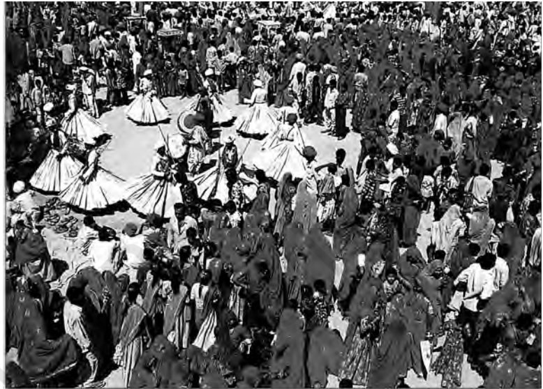
A tribal village fair

During the 1960s scholars debated whether tribes should be seen as one end of a continuum with caste-based (Hindu) peasant society, or whether they were an altogether different kind of community. Those who argued for the continuum saw tribes as not being fundamentally different from caste-peasant society, but merely less stratified (fewer levels of hierarchy) and with a more community-based rather than individual notion of resource ownership. However, opponents argued that tribes were wholly different from castes because they had no notion of purity and pollution which is central to the caste system.