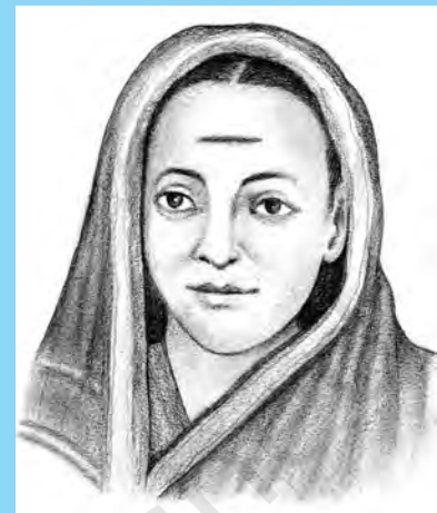
Savitri Bai Phule (1831–1897)

Savitri Bai Phule was the first headmistress of the country's first school for girls in Pune. She devoted her life to educating Shudras and Ati-Shudras. She started a night school for agriculturists and labourers. She died while serving plague patients.