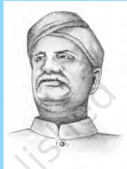
Ayyankali (1863 – 1914)

Ayyankali, born in Kerala, was a leader of the lower castes and Dalits. With his efforts, Dalits got the freedom to walk on public roads, and Dalit children were allowed to join schools.