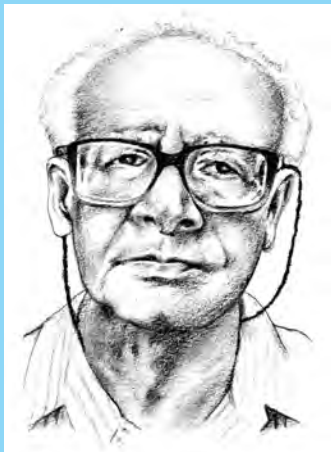
M. N. Srinivas (1916–1999)

Mysore Narasimhachar Srinivas was one of India's foremost sociologists and social anthropologists. He was known for his works on the caste system and terms such as 'sanskritisation' and 'dominant caste'. His book The Remembered Village is one of the best known village studies in Social Anthropology.