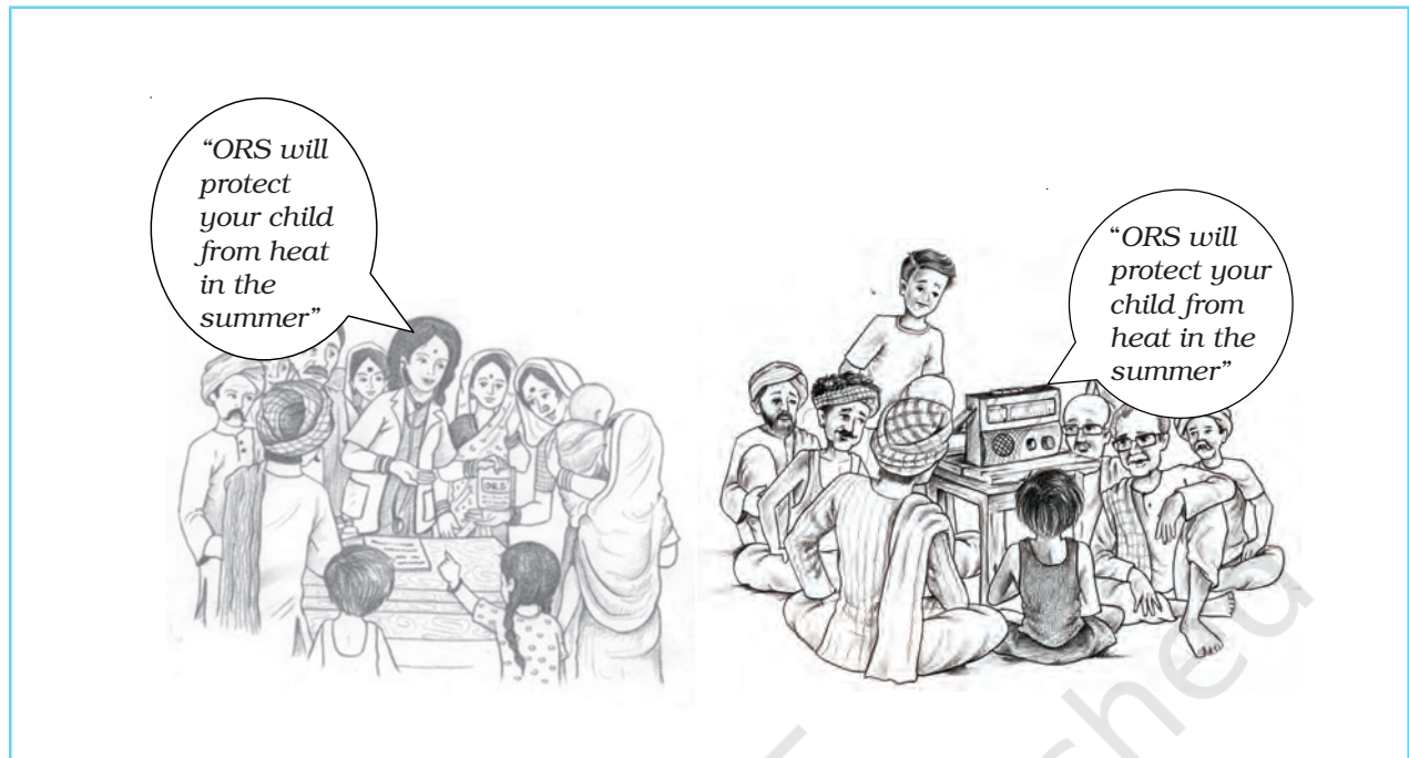
Fig.6.3 : Face-to-face Interaction versus Media Transmission. Which one works better? Why?

Finally, the mode of spreading the message plays a significant role. Face-to-face transmission of the message is usually more effective than indirect transmission, as for instance, through letters and pamphlets, or even through mass media. For example, a positive attitude towards Oral Rehydration Salts (ORS) for young children is more effectively created if community social workers and doctors spread the message by talking to people directly, than by only describing the benefits of ORS on the radio (see Figure 6.3). These days transmission through visual media such as television and the Internet are similar to face-to-face interaction, but not a substitute for the latter.