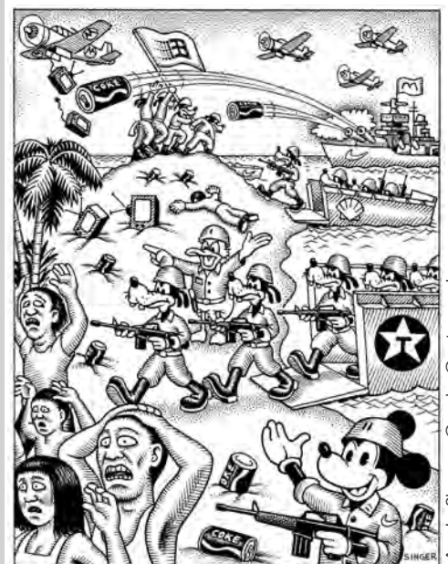
Invading new markets

Advocates of economic globalisation argue that it generates greater economic growth and well-being for larger sections of the population when there is de-regulation. Greater trade among countries allows each economy to do what it does best. This would benefit the whole world. They also argue that economic globalisation is inevitable and it is not wise to resist the march of history. More moderate supporters of globalisation say that globalisation provides a challenge that can be responded to intelligently without accepting it uncritically.