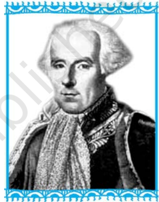
P.S. Laplace (1749-1827)

\frac{a_1}{a_2} \neq \frac{b_1}{b_2} or, a_1 b_2 - a_2 b_1 \neq 0 , then the system of linear equations has a unique solution). The number a_1 b_2 - a_2 b_1