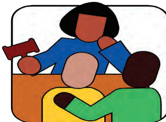
Fig. 20.2: Consumer Protection

The Government of India has accepted, established and enshrined six consumer rights under the Consumer Protection Act (CPA) 1986 . There are four basic rights— (i) right to safety, (ii) right to be informed, (iii) right to choose and (iv) right to be heard. Two additional rights are—right to redressal and right to education.