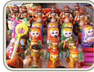
Channapatna dolls of Karnataka