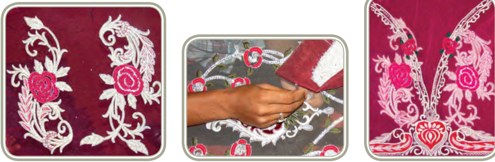
Embroidery and Textiles of India

India has a multiplicity of visual arts that have been in practice for over four thousand years. Historically, the artists and artisans were supported by two main categories of patrons: the larger Hindu temples and the princely rulers of various states. The main visual arts arose in the context of religious worship. Distinctive regional styles of architecture are seen in different parts of India, reflecting various religions namely Islam, Sikhism, Jainism, Christianity and Hinduism, which typically co-existed across the country. Therefore in different places of worship and mausoleums (burial chambers), palaces, etc. a great variety of images skilfully carved in stone, or cast in bronze or silver, or modeled in terra-cotta or wood or colourfully painted were commonly prevalent, most of which have been preserved in India's vast heritage. In the modern scenario, these arts are preserved and promoted through the efforts of government and several non-governmental organisations, providing occupational avenues including entrepreneurship.