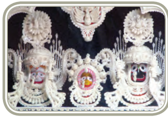
Shola craft of Odisha

In the past many of these were made for daily use and others for decorative purposes. These occupations and many others are reflective of the base of the socio-economic culture. However, the modern economy has catapulted such craft items into the global market, earning the country considerable foreign exchange.