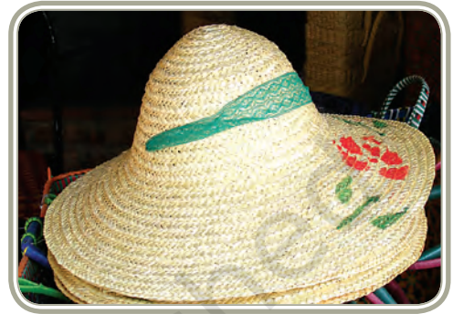
Bamboo craft of Assam

These are tremendous challenges and indicate an urgent need for the revival and sustaining of the indigenous knowledge, know-how and skills which are fast losing ground. Some of the areas where interventions are required are design innovations, preservation and refinement strategies, use of eco-friendly raw materials, packaging, establishment of training facilities, conservation of traditional knowledge and protection of intellectual property rights (IPR). It is important for the modern youth and communities to be aware of the tremendous scope and potential for career avenues for individuals. In addition, such efforts and initiatives will go a long way to enhance the income generation potential of the rural folk. It is worthy to note that the Government of India is making concerted efforts in this direction. The need of the hour and the challenge confronting Indian society is to maintain the diversity without the hierarchy or caste-based work divisions in the democratic milieu.