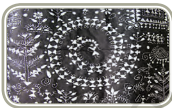
Warli Painting of Maharashtra

India has a multiplicity of visual arts that have been in practice for over four thousand years. Historically, the artists and artisans were supported by two main categories of patrons: the larger Hindu temples and the princely rulers of various states. The main visual arts arose in the context of religious worship. Distinctive regional styles of architecture are seen in different parts of India, reflecting various religions namely Islam, Sikhism, Jainism, Christianity and Hinduism, which typically co-existed across the country. Therefore in different places of worship and mausoleums (burial chambers), palaces, etc. a great variety of images skilfully carved in stone, or cast in bronze or silver, or modeled in terra-cotta or wood or colourfully painted were commonly prevalent, most of which have been preserved in India's vast heritage. In the modern scenario, these arts are preserved and promoted through the efforts of government and several non-governmental organisations, providing occupational avenues including entrepreneurship.