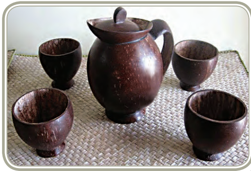
Coconut craft of Kerala

hand and a gradual erosion of the aesthetic appreciation of fine arts on the other. Illiteracy, general socio-economic backwardness, slow progress in implementing land reforms and inadequate or inefficient finance and marketing services are major constraints that cause this trend. Shrinkage of forests, depletion of resource base and general environmental degradation are responsible for various problems faced in this context.