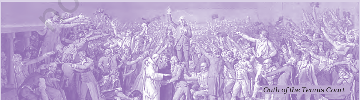
Oath of the Tennis Court

CONSTITUENT ASSEMBLY DEBATES (CAD), VOL.I