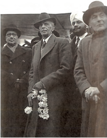
Fig. 12.8 In the winter of 1946 Indian leaders went to London for what turned out to be a fruitless round of talks with British Prime Minister Attlee. (Left to right: Liaquat Ali, Mohammad Ali Jinnah, Baldev Singh and Pethick-Lawrence)