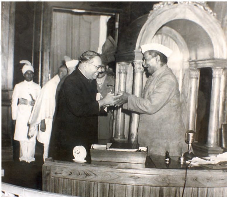
Fig. 12. 9 B. R. Ambedkar and Rajendra Prasad greeting each other at the time of the handing over of the Constitution

The Constituent Assembly debates help us understand the many conflicting voices that had to be negotiated in framing the Constitution, and the many demands that were articulated. They tell us about the ideals that were invoked and the principles that the makers of the Constitution operated with. But in reading these debates we need to be aware that the ideals invoked were very often re-worked according to what seemed appropriate within a context. At times the members of the Assembly also changed their ideas as the debate unfolded over three years. Hearing others argue, some members rethought their positions, opening their minds to contrary views, while others changed their views in reaction to the events around.