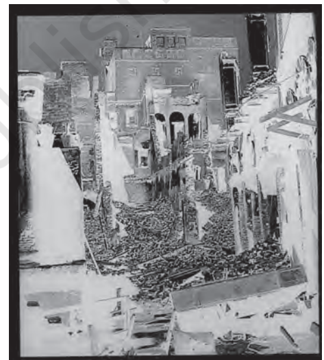
Fig. 12.2 Images of desolation and destruction continued to haunt members of the Constituent Assembly.

On Independence Day, 15 August 1947, there was an outburst of joy and hope, unforgettable for those who lived through that time. But innumerable Muslims in India, and Hindus and Sikhs in Pakistan, were now faced with a cruel choice – the threat of