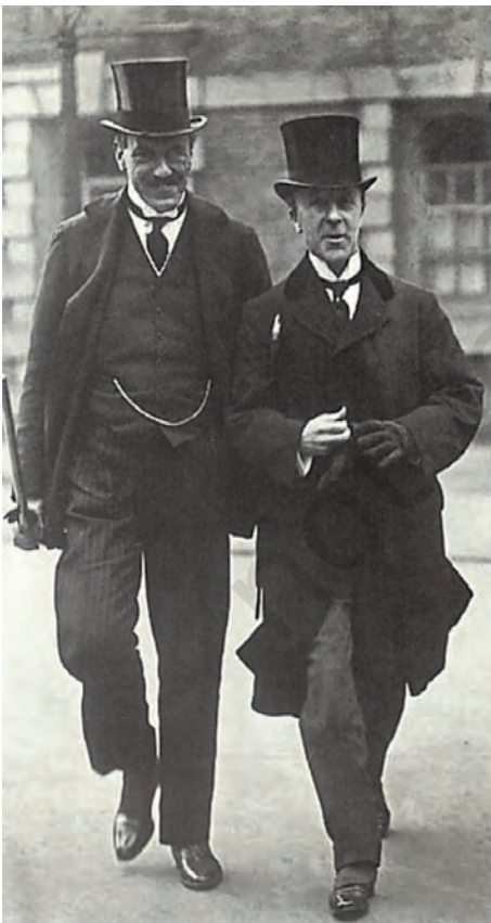
Fig. 12.7 Edwin Montague (left) was the author of the Montague-Chelmsford Reforms of 1919 which allowed some form of representation in provincial legislative assemblies.

Nehru admitted that most nationalist leaders had wanted a different kind of Constituent Assembly. It was also true, in a sense, that the British Government had a “hand in its birth”, and it had attached certain conditions within which the Assembly had to function. “But,” emphasised Nehru, “you must not ignore the source from which this Assembly derives its strength.”