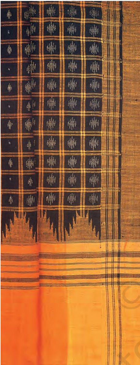
Fig. 5.10 Ikat weaving patterns such as this were adopted and modified at several coastal production centres in the subcontinent and in Southeast Asia.

➤ Why do you think Ibn Battuta highlighted these activities in his description?