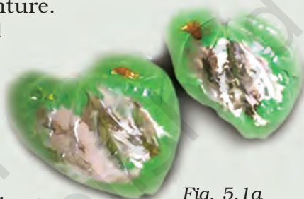
Fig. 5.1a Paan leaves

In this chapter we shall see how our knowledge of the past can be enriched through a consideration of descriptions of social life provided by travellers who visited the subcontinent, focusing on the accounts of three men: Al-Biruni who came from Uzbekistan (eleventh century), Ibn Battuta who came from Morocco, in northwestern Africa (fourteenth century) and the Frenchman François Bernier (seventeenth century).