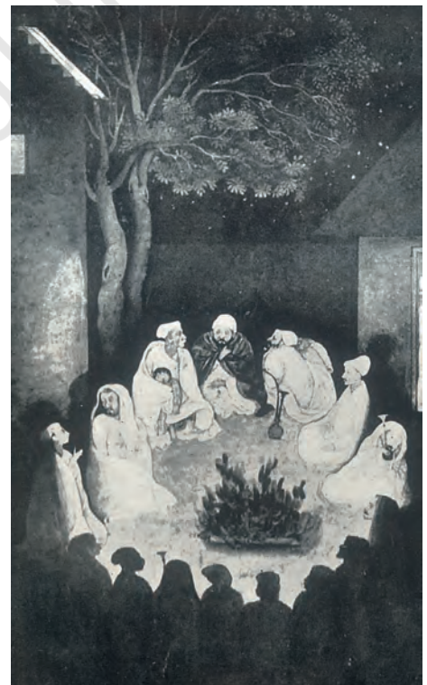
Fig. 5.5 An eighteenth-century painting depicting travellers gathered around a campfire

Among the best known of these writers were Abdur Razzaq Samarqandi, who visited south India in the 1440s, Mahmud Wali Balkhi, who travelled very widely in the 1620s, and Shaikh Ali Hazin, who came to north India in the 1740s. Some of these authors were fascinated by India, and one of them – Mahmud Balkhi – even became a sort of sanyasi for a time. Others such as Hazin were disappointed and even disgusted with India, where they expected to receive a red carpet treatment. Most of them saw India as a land of wonders.