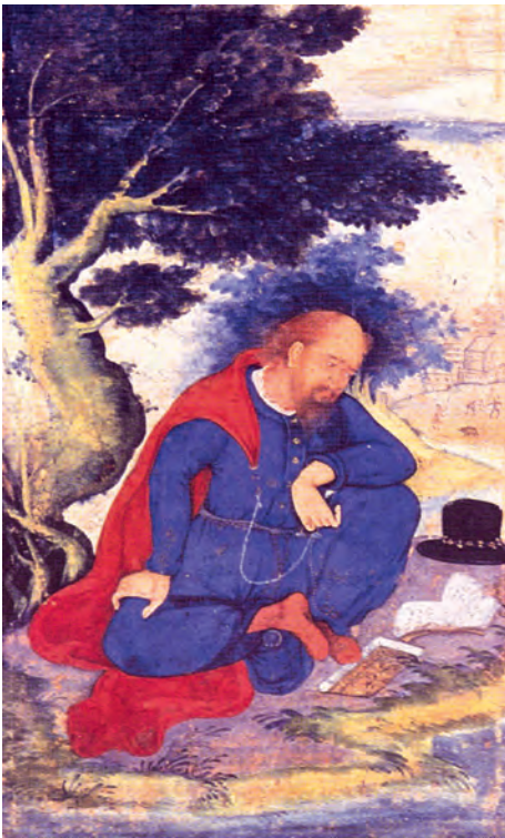
Fig. 5.6 A seventeenth-century painting depicting Bernier in European clothes