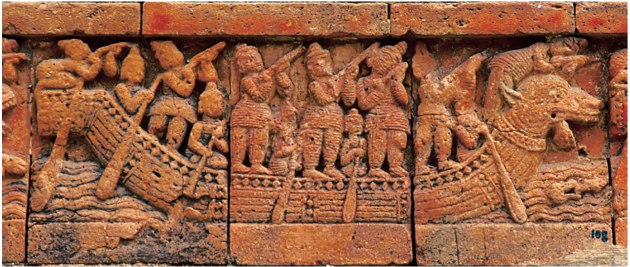
Fig. 5.4 A boat carrying passengers, a terracotta sculpture from a temple in Bengal (c. seventeenth-eighteenth centuries)

Zaytun (now known as Quanzhou). He travelled extensively in China, going as far as Beijing, but did not stay for long, deciding to return home in 1347. His account is often compared with that of Marco Polo, who visited China (and also India) from his home base in Venice in the late thirteenth century.