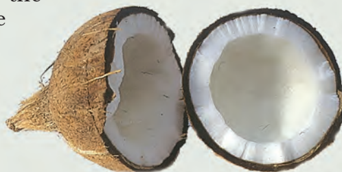
Fig. 5.1b A coconut The coconut and the paan were things that struck many travellers as unusual.