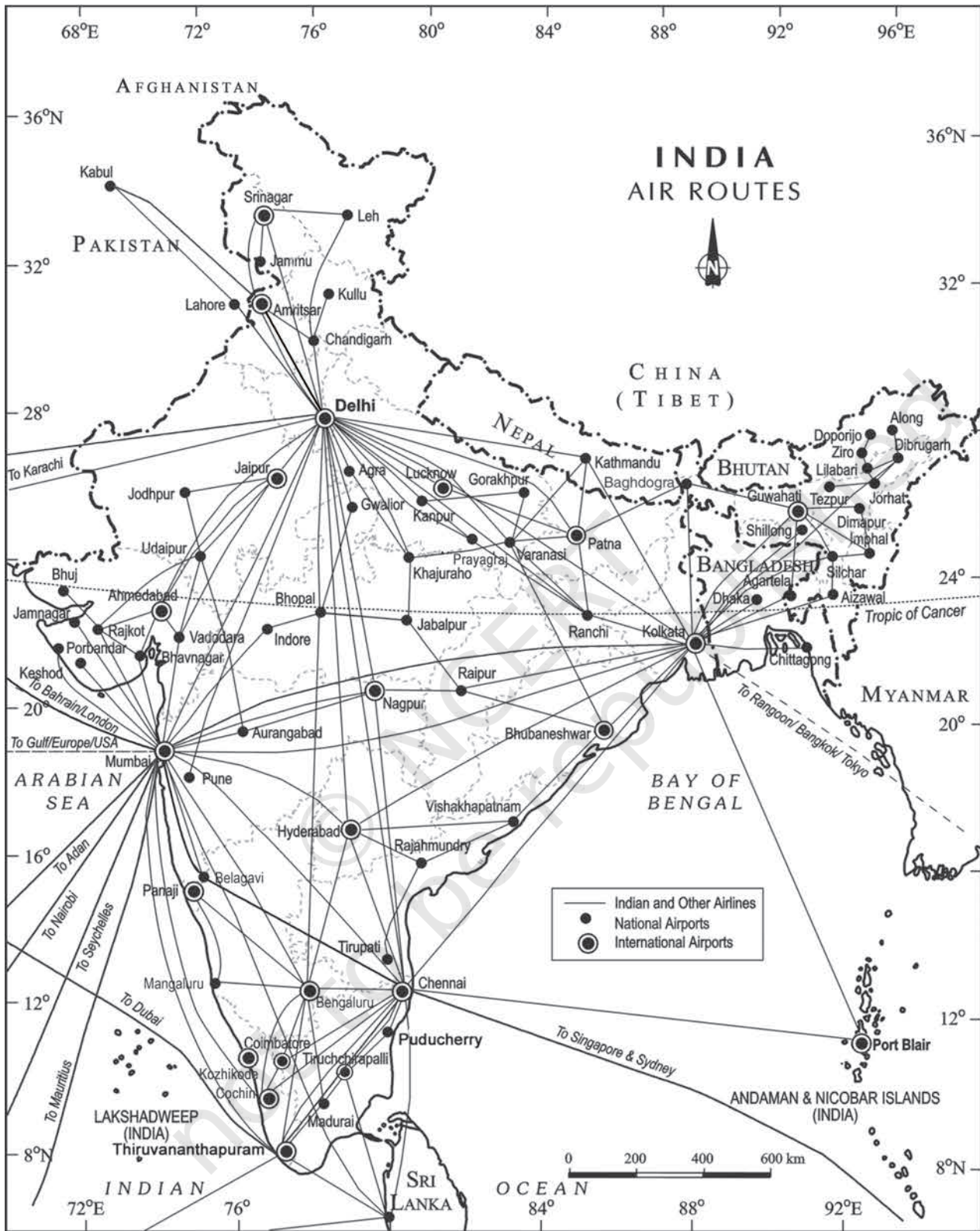
Fig. 8.5 : India - Air Routes