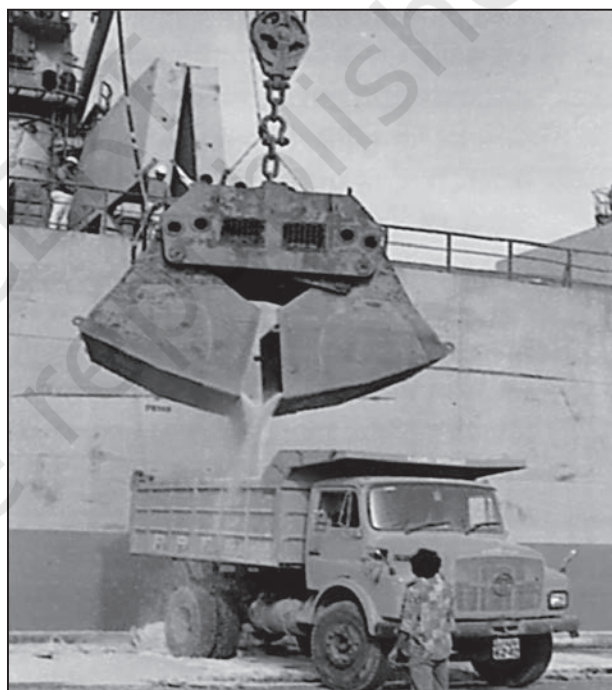
Fig. 8.3 : Unloading of goods on port

India is surrounded by sea from three sides and is bestowed with a long coastline. Water provides a smooth surface for very cheap transport provided there is no turbulence. India