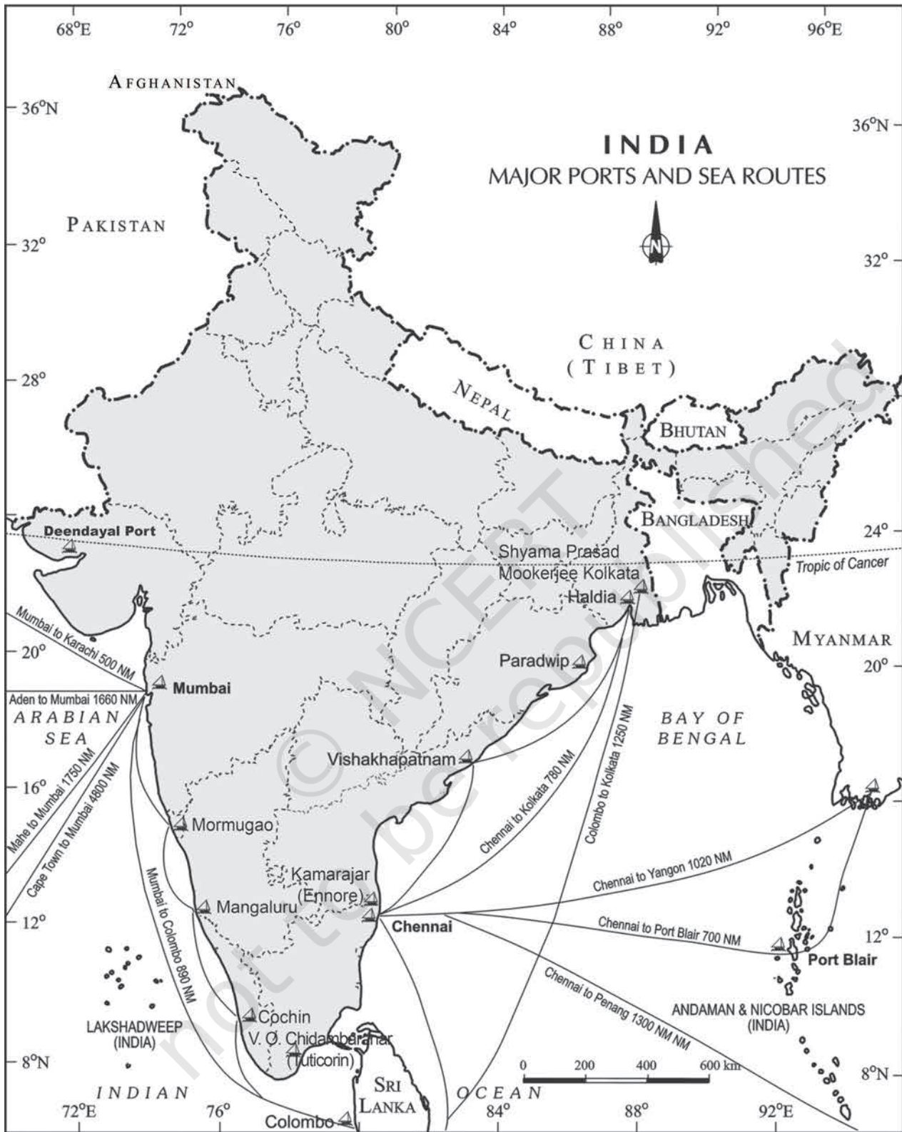
Fig. 8.4 : India - Major Ports and Sea Routes