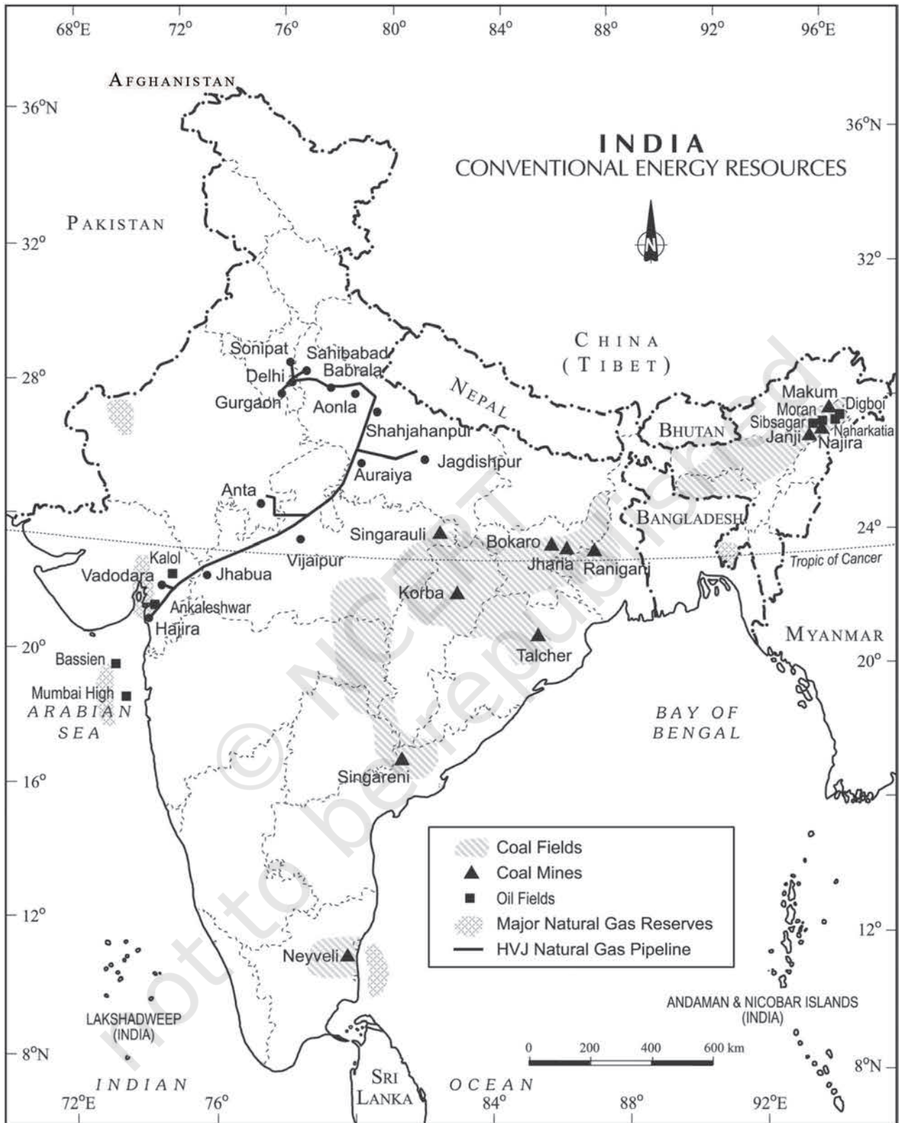
Fig. 5.4 : India - Conventional Energy Resources

Activity: Collect information about cross country natural gas pipelines laid by GAIL (India) under 'One Nation One Grid'.