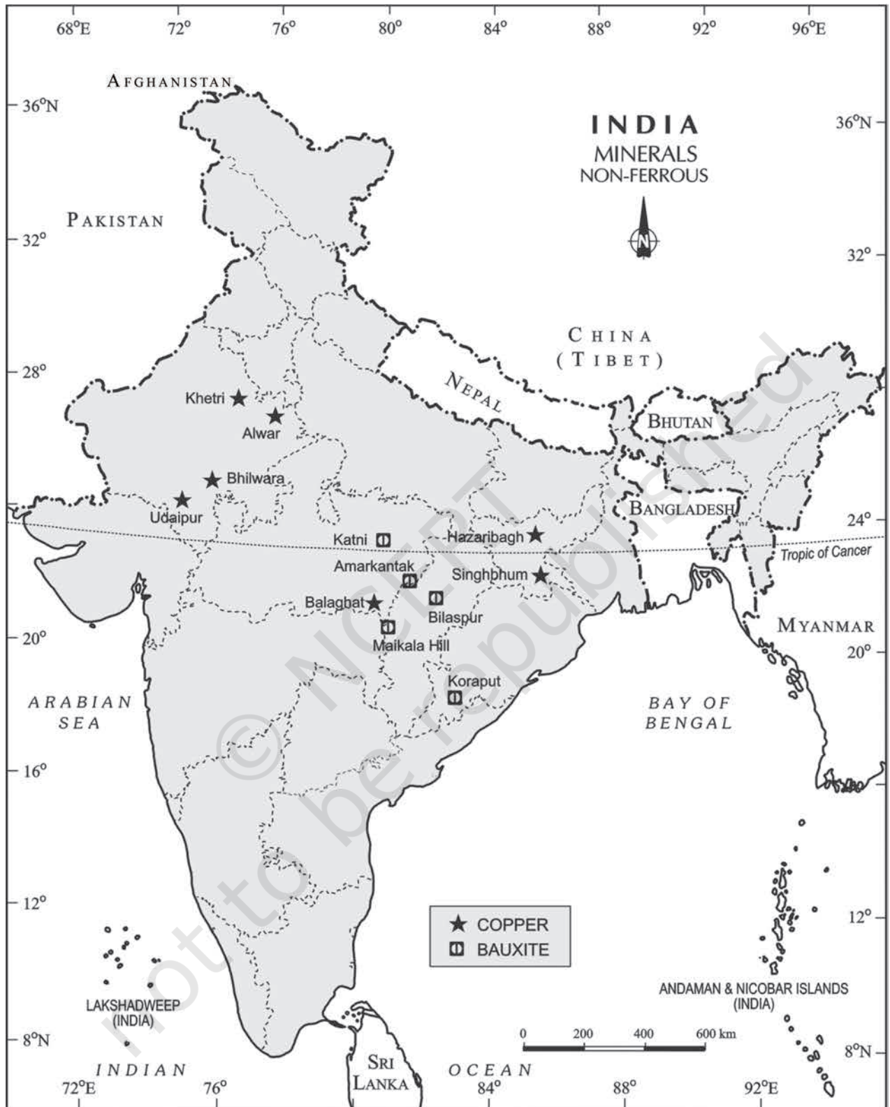
Fig. 5.3 : India – Minerals (Non-Ferrous)