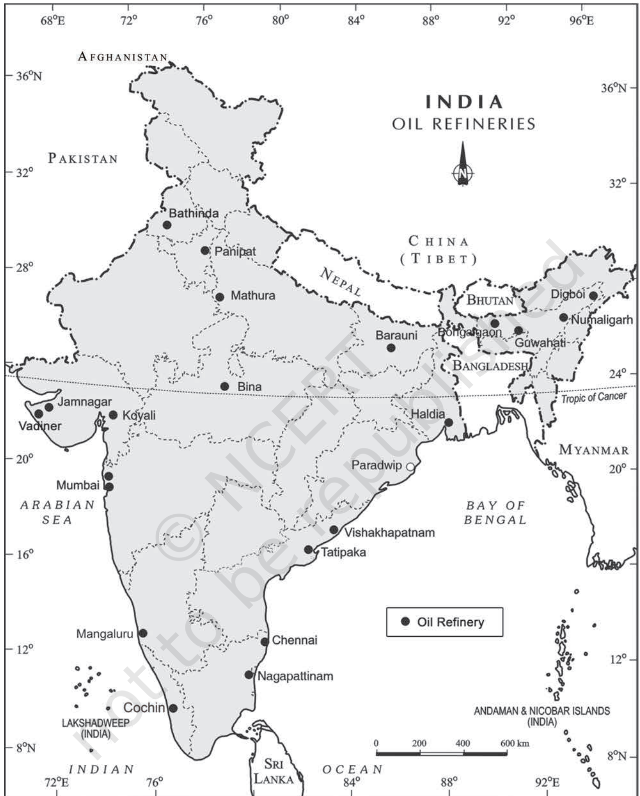
Fig. 5.5 : India - Oil Refineries