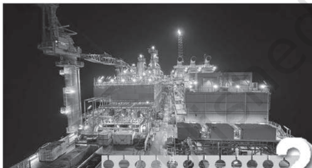
ONGC commencing its first oil production from Kakinada coast on January 7.

The block will help increase ONGC's total production of oil and natural gas by 11% and 15% respectively; peak production of the field is expected to be around 45,000 barrels of oil per day and over 10 MMSCMD of gas