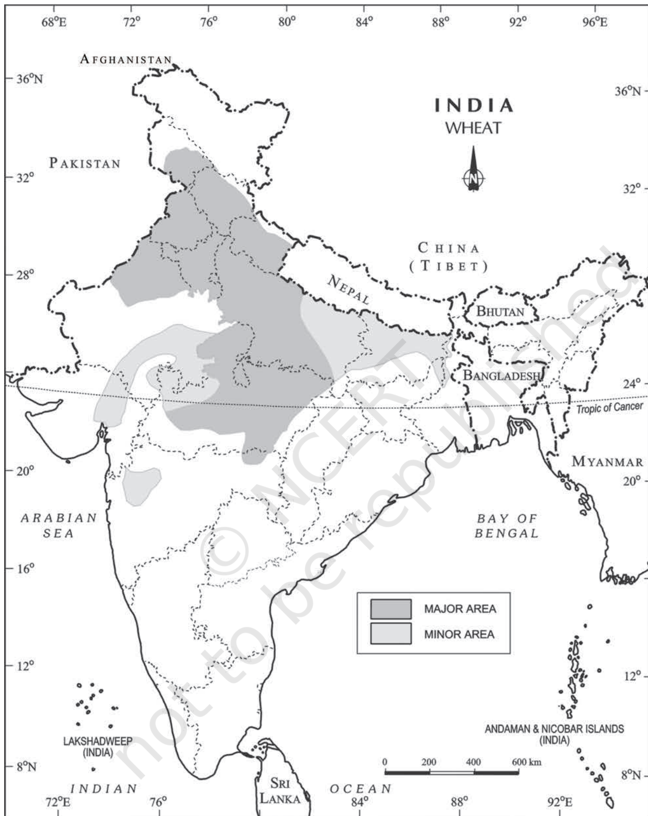
Fig. 3.4 : India – Distribution of Wheat