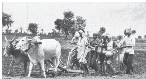
Fig. 3.5 : Farmers sowing soyabean seeds in Amravati, Maharashtra

Soyabean and sunflower are other important oilseeds grown in India. Soyabean is mostly grown in Madhya Pradesh and Maharashtra.