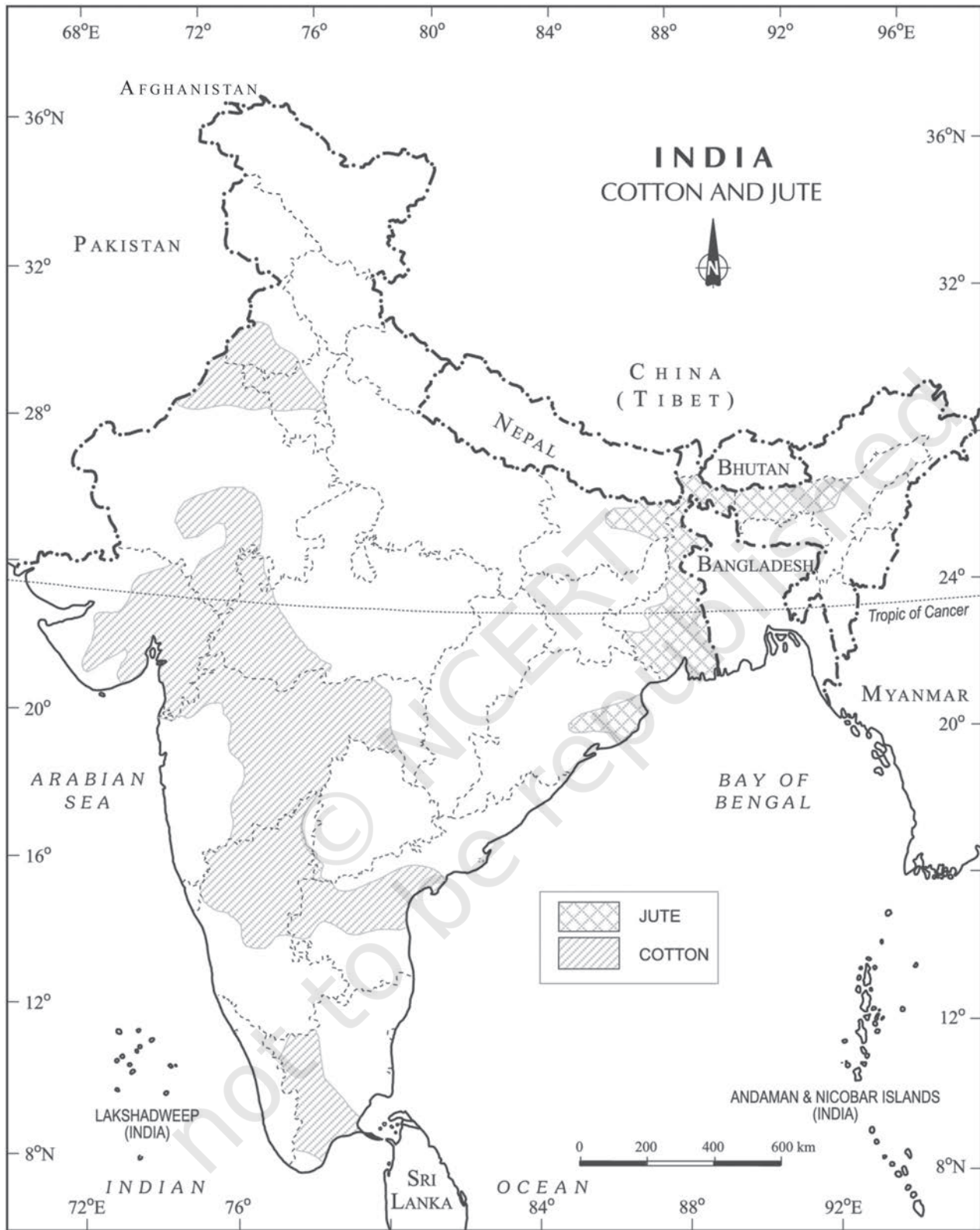
Fig. 3.6 : India - Distribution of Cotton and Jute