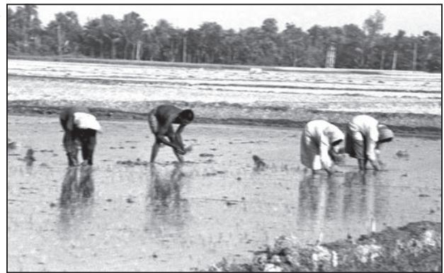
Fig. 3.2 : Rice transplantation in southern parts of India

India contributes 22.07 per cent of rice production in the world and ranked second after China in 2018. About one-fourth of the total cropped area in the country is under rice cultivation. West Bengal, Uttar Pradesh, and Punjab are the leading rice producing states in the country. The yield level of rice is high in Punjab, Tamil Nadu, Haryana, Andhra Pradesh, Telangana, West Bengal and Kerala. In the first four of these states almost the entire land under rice cultivation is irrigated. Punjab and Haryana are not traditional rice growing areas. Rice