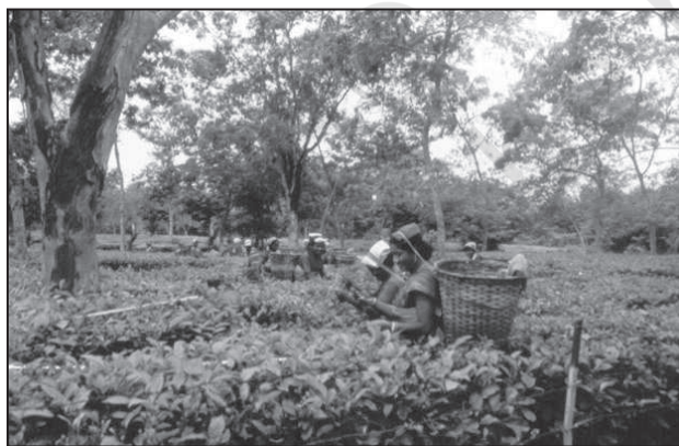
Fig. 3.10 : Tea Farming

Tea is a plantation crop used as beverage. Black tea leaves are fermented whereas green tea leaves are unfermented. Tea leaves have rich content of caffeine and tannin. It is an indigenous crop of hills in northern China. It is grown over undulating topography of hilly areas and well-drained soils in humid and sub-humid tropics and sub-tropics. In India, tea plantation started in 1840s in Brahmaputra valley of Assam which still is a major tea growing area in the country. Later on, its plantation was introduced in the sub-Himalayan region of West Bengal (Darjeeling, Jalpaiguri and Cooch Behar districts). Tea is also cultivated on the lower slopes of Nilgiri and