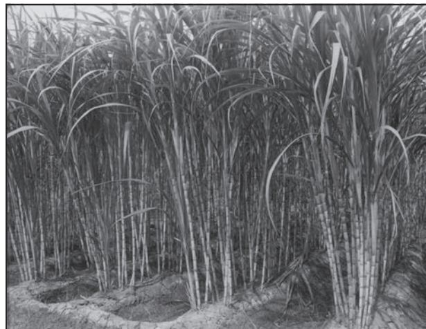
Fig. 3.8 : Sugarcane Cultivation

Sugarcane is a crop of tropical areas. Under rainfed conditions, it is cultivated in sub-humid and humid climates. But it is largely an irrigated crop in India. In Indo-Gangetic plain, its cultivation is largely concentrated in Uttar Pradesh. Sugarcane growing area in western India is spread over Maharashtra and Gujarat.