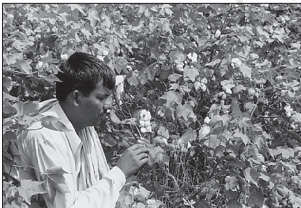
Fig. 3.7 : Cotton Cultivation

Cotton is a tropical crop grown in kharif season in semi-arid areas of the country. India lost a large proportion of cotton growing area to Pakistan during partition. However, its acreage has increased considerably during the last 50 years. India grows both short staple (Indian) cotton as well as long staple (American) cotton called ' narma ' in north-western parts of the country. Cotton requires clear sky during flowering stage.