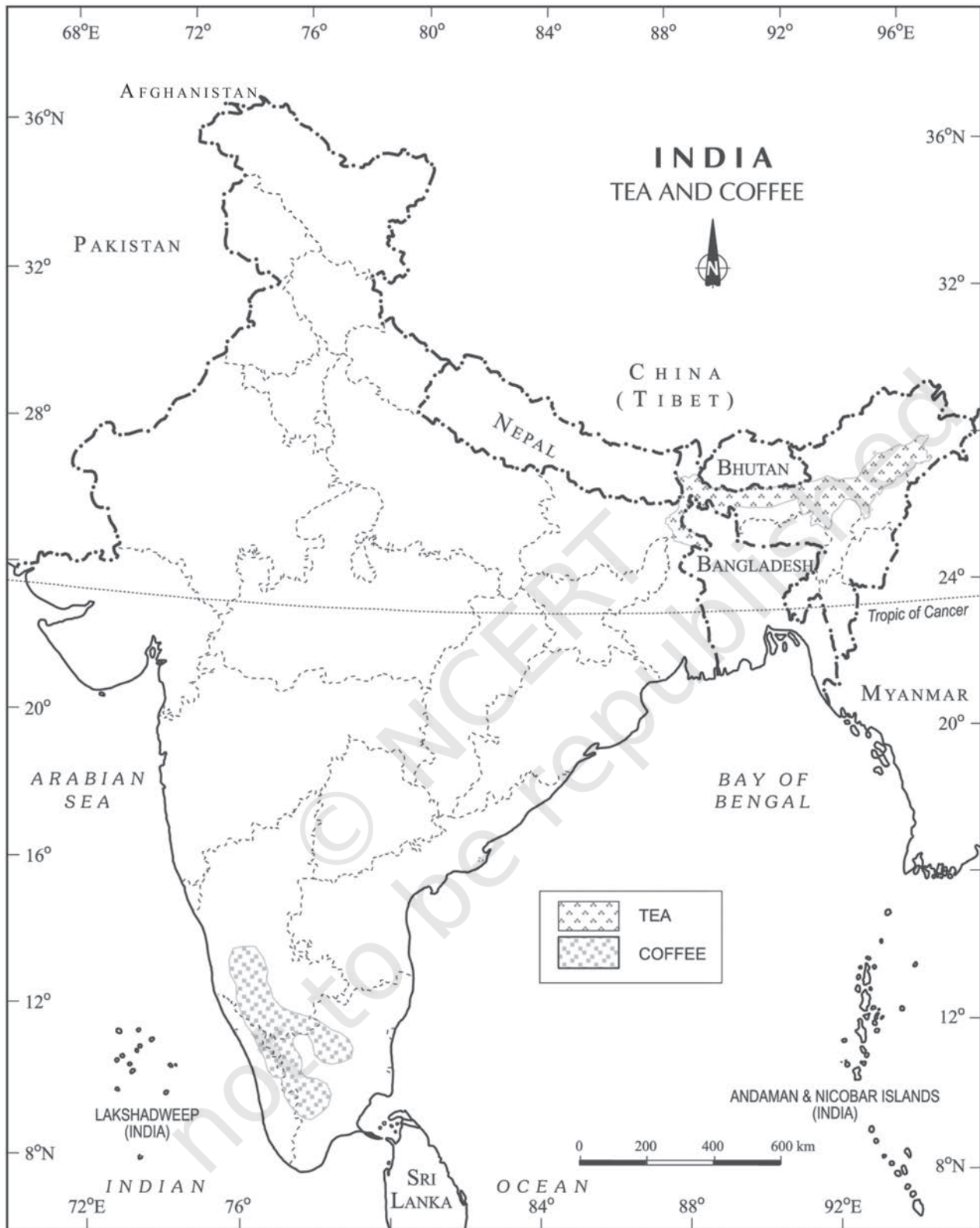
Fig. 3.11 : India - Distribution of Tea and Coffee