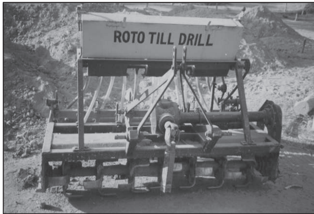
Fig. 3.12 : Roto Till Drill—A modern agricultural equipment