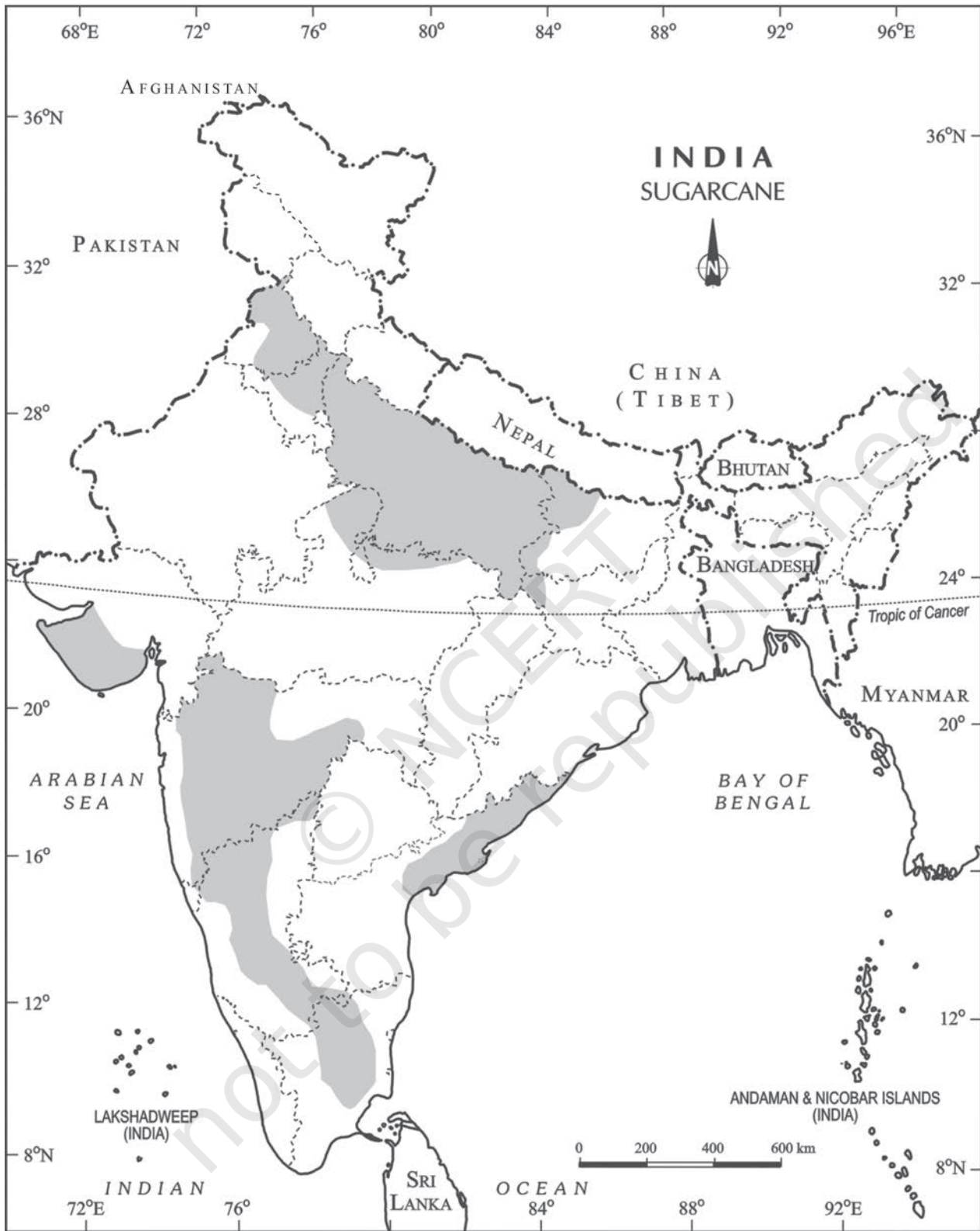
Fig. 3.9 : India – Distribution of Sugarcane